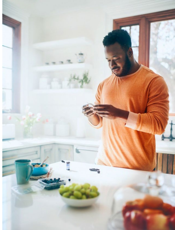
Photo is for representative purposes only and does not depict an actual patient.