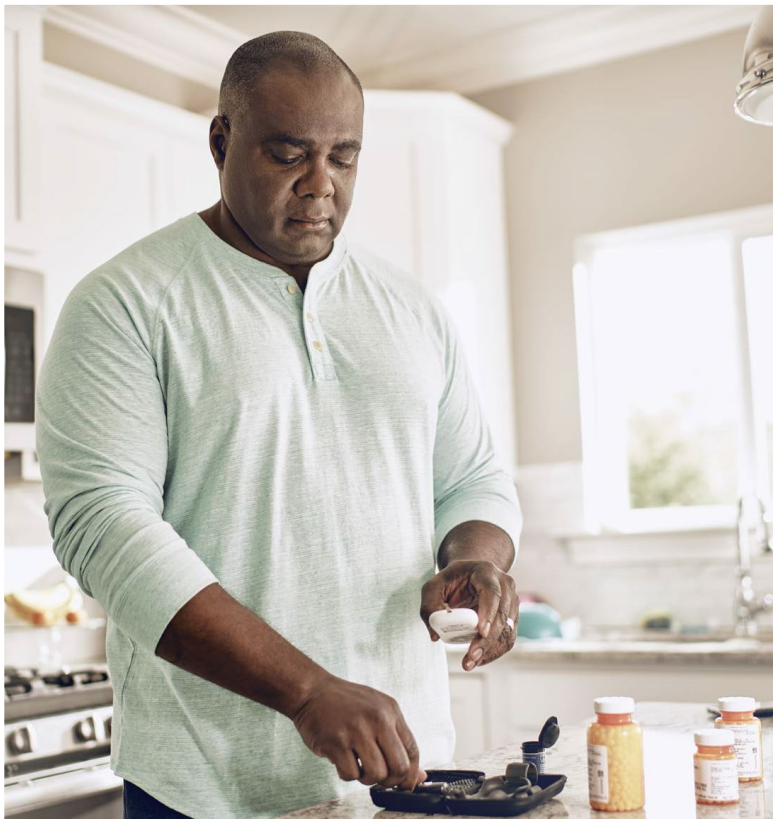
Photo is for representative purposes only and does not depict an actual patient.

• Access affordable prescription drugs safely and efficiently